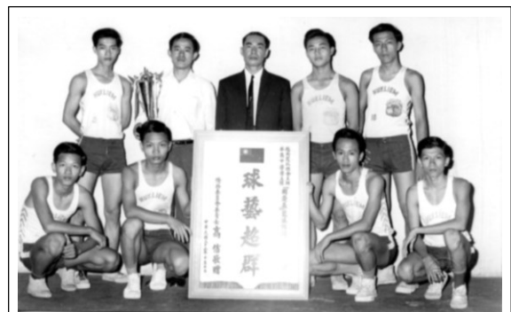
The basketball team of William Lin Middle School won a championship (1963)